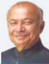
Hon. Sushil Kumar Shinde

Former Home minister, Government of India, Former Chief Minister of Maharashtra