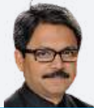
Hon. Md. Shahriar Alam

Former Home minister, Government of India, Former Chief Minister of Maharashtra