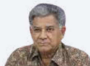
Brigadier General (Rtd) Dr. M Sakhawat Hossain

Member of Parliament, Parliament of Bangladesh