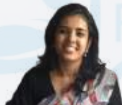
Ms. Lalita Silwal

High Commissioner at High Commission of the Kingdom of Lesotho