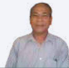
Hon. Sunil Manandhar

State Minister of Education, Government of Nepal