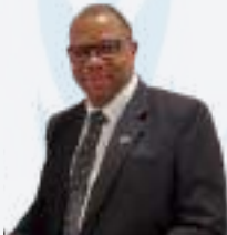
H.E Thabang Linus Kholumo

High Commissioner at High Commission of Brunei Darussalam in Bangladesh