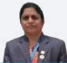
Hon. Bodhmaya Yadav

State Minister of Foreign Affairs, Government of Bangladesh