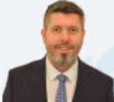
H.E Güner Ureya

Former Minister of Environment, Government of Nepal